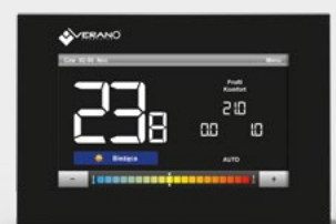
Room temperature controller in black colour (VER-24 Black)