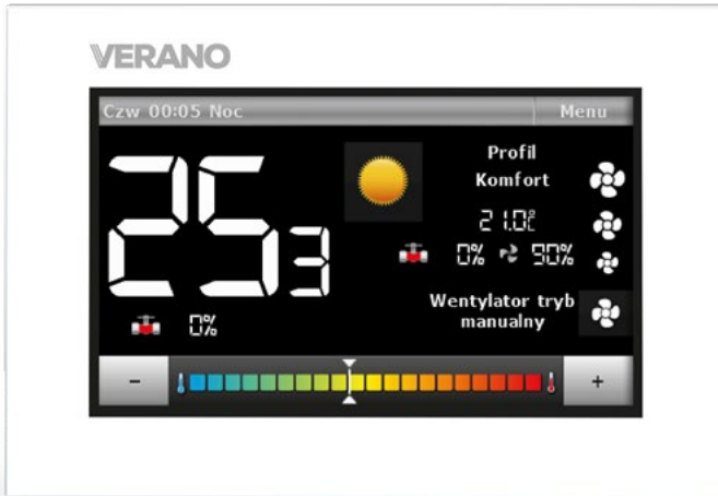
Room temperature controller in white colour (VER-24 White)