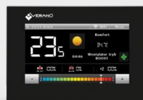
Room temperature controller in black colour (VER-24 WiFi Black)