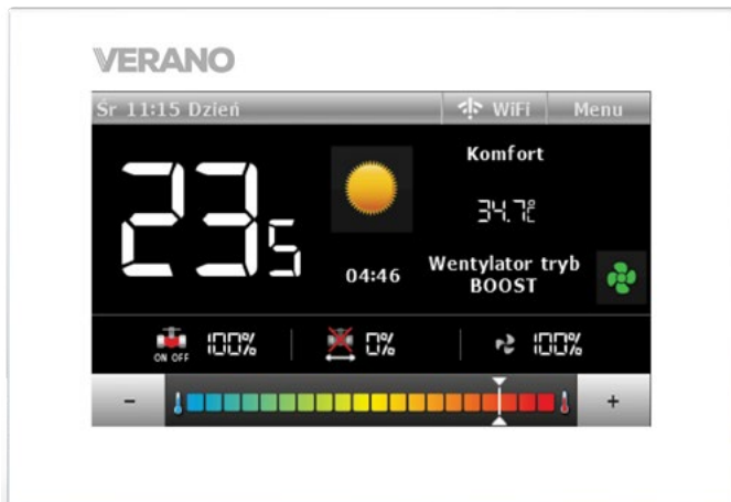
Room temperature controller in white colour (VER-24 WiFi White)