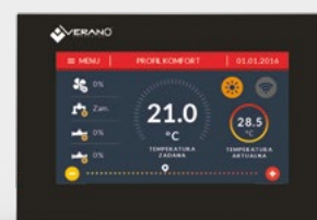
Room temperature controller in black colour (VER-44 WiFi Black)